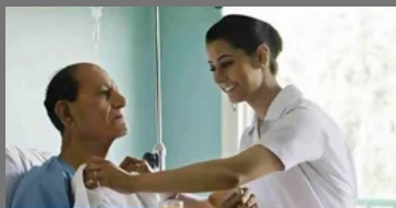
Home Health Aide Program Medical Courses