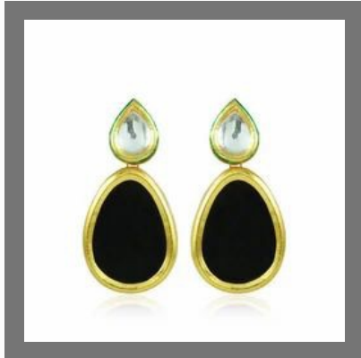
Black Sheet Kundan Earring