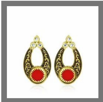
Indian Tribal Sheets Earring