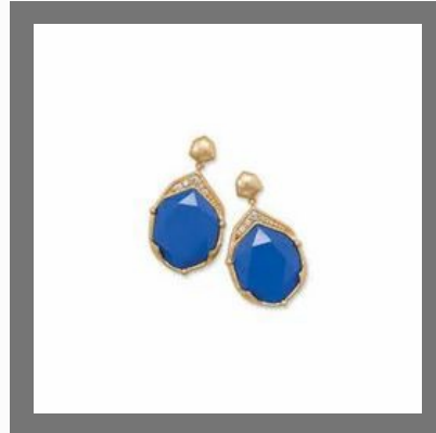
Blue Kundan Earring