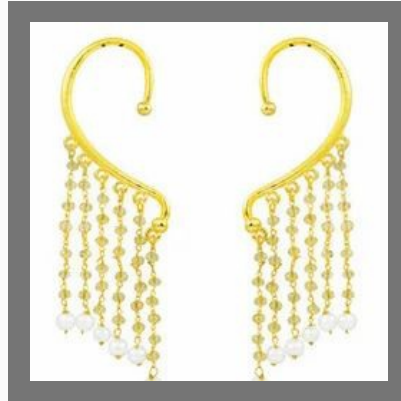
Gold Plated Glass Beads Ear Cuff