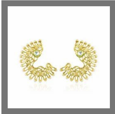
Golden Kundan Rajwadi Bead Ear Cuff