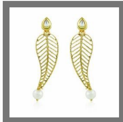
Kundan Lazer Cut Earring