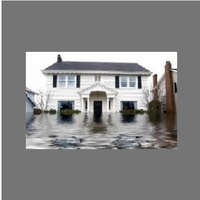
Home Insurance Service