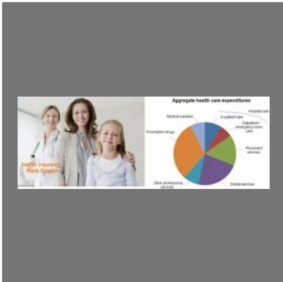
Health Insurance Service