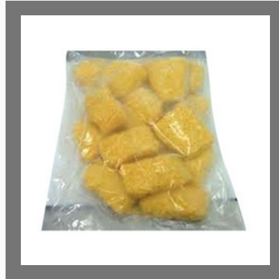
Frozen Pangasius Nugget