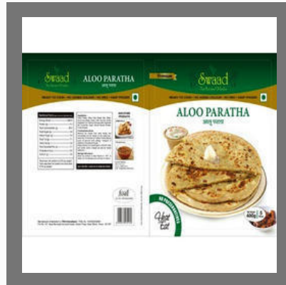
Frozen Aloo Paratha