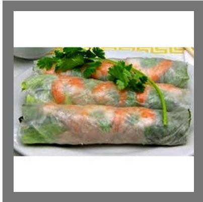
Frozen Vegetable Spring Rolls