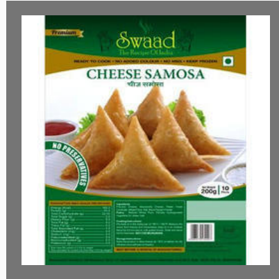
Frozen Cheese Samosa