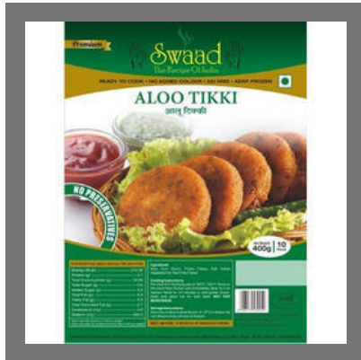
Frozen Aloo Tikki