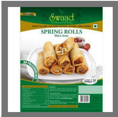
Frozen Spring Rolls