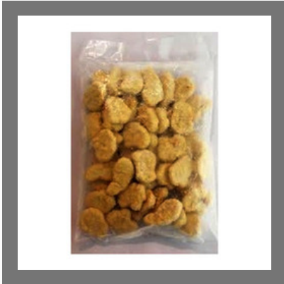
Frozen Vegetable Nugget