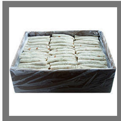
Cheese Spring Rolls