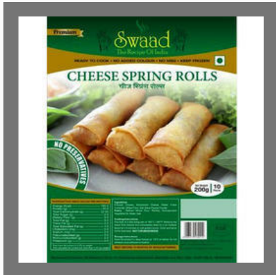
Frozen Cheese Spring Roll