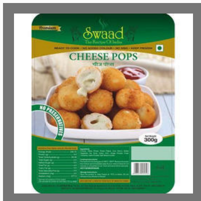
Frozen Cheese Pops