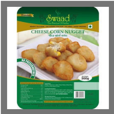
Frozen Cheese Corn Nugget