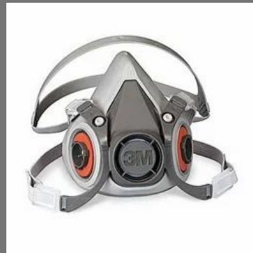
3M 6000 Series Half Face Piece Respirator