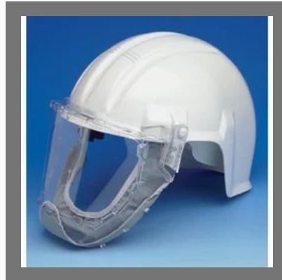
3M High Efficiency Helmet