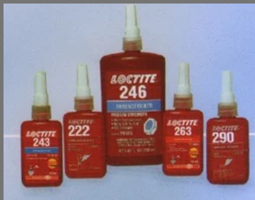
Thread Locking Adhesives