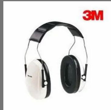
3M Economy Ear Muffs