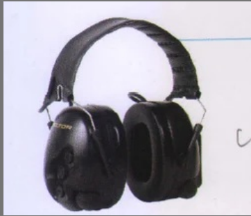
3M Tactical Pro Hearing Protector