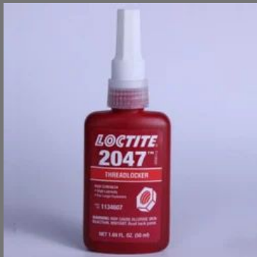
Loctite Liquid Thread Locker