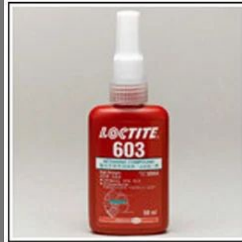
Retaining Compound Chemical Adhesive