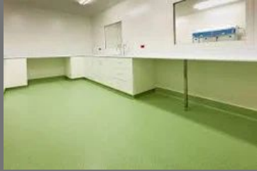
Anti Static Flooring