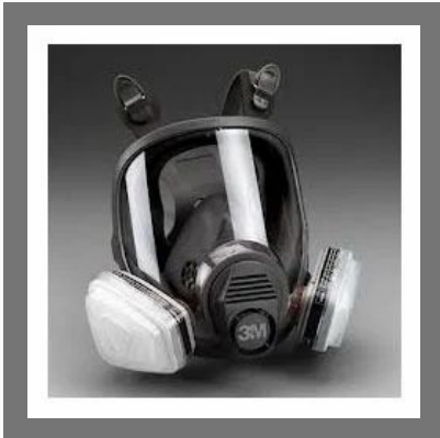
3M Automotive Respirators