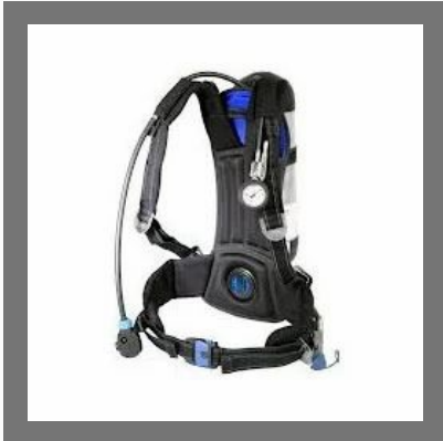
Self Contained Breathing Apparatus