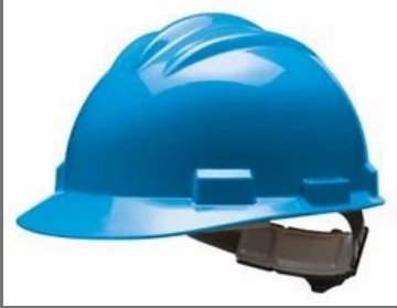
Pinlock Suspension Safety Helmets