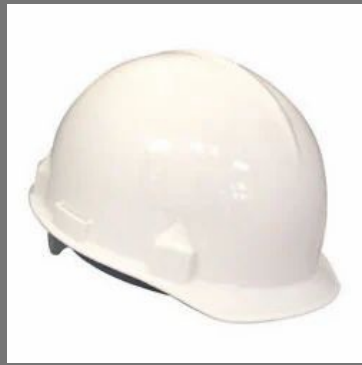
Ratchet Suspension Safety Helmets