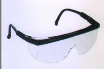
Eye Protection Goggle