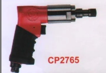
Battery Cordless Screwdriver