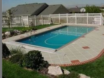
Concrete Repair Compounds