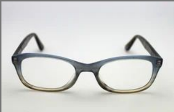
Eye Protective Spectacles