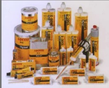
Epoxy and Urethane Adhesives