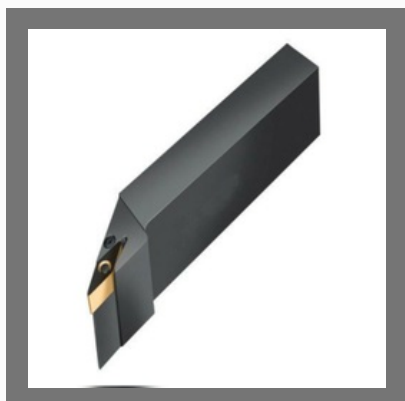
Cnc Cutting Tool