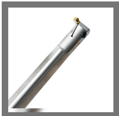
Cnc Insert Took