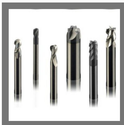
Ms Cnc Insert