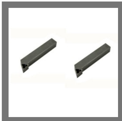
Vmc Insert Tool