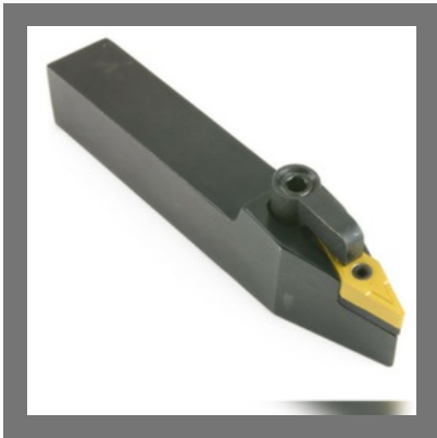
Cnc Vmc Tools