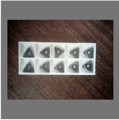
Cnc Threading Insert