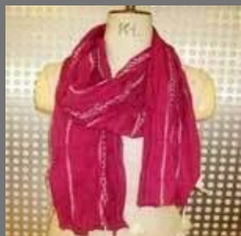
Embroidered Scarves 1