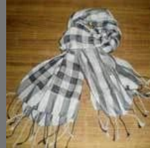
Double Sided Scarves1