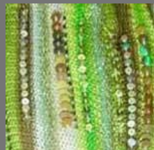
Embellished Scarves 1