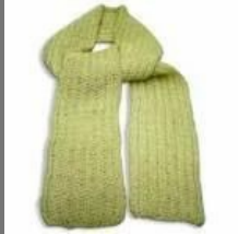
Knitted Scarves 1