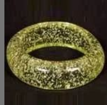
Resin Jewellery- Bangles