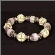
Bone Jewellery- Bone Bracelet