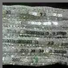
Embellished Scarve - 04