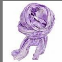
Tie & Dye Scarve - 02