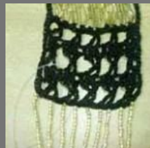
Embellished Scarve - 02