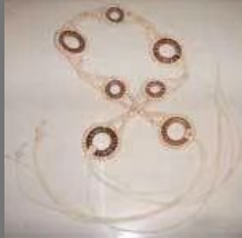
Beaded Belts 1