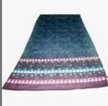
Printed Scarves 1