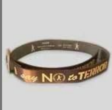
Leather Belts 1