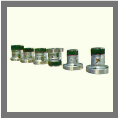
VG20 CC A6 42 CNC Collets Chuck