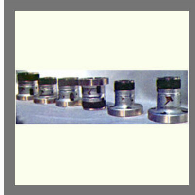
VG20 CC A6 60 CNC Collets Chuck