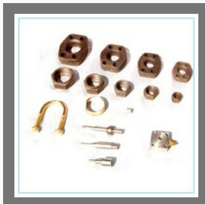
Hydraulic Spare Parts