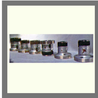
VG20 CC A5 42 CNC Collets Chuck