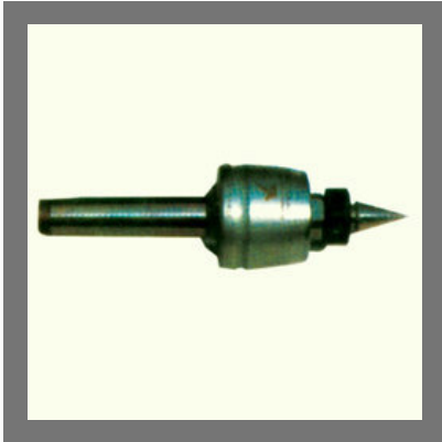
CNC Revolving Center