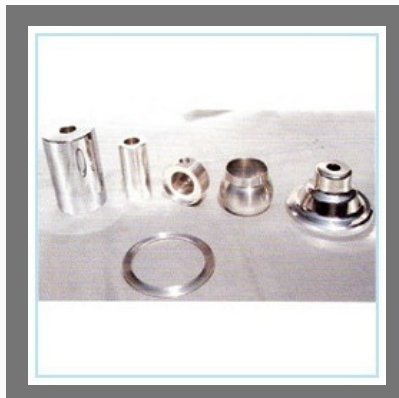
Defence, Aerospace & Critical Components