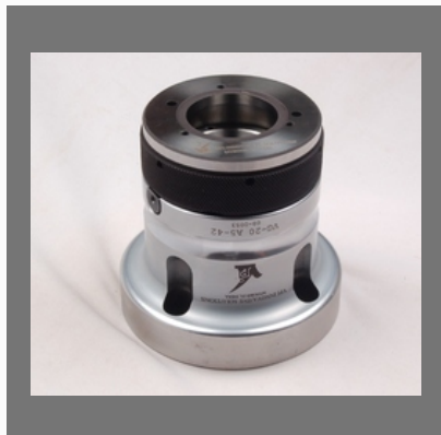
High Speed Collet Chucks For CNC Turning Centres