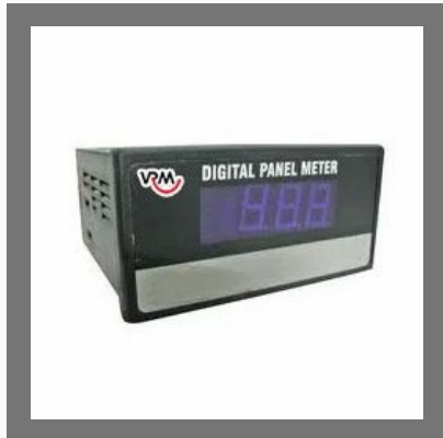
Digital Panel Meter