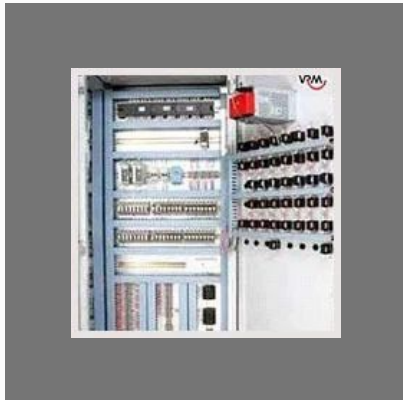
Electric Control Panel