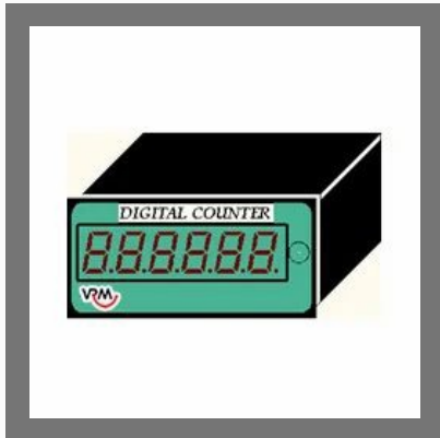
Digital Counter Standard