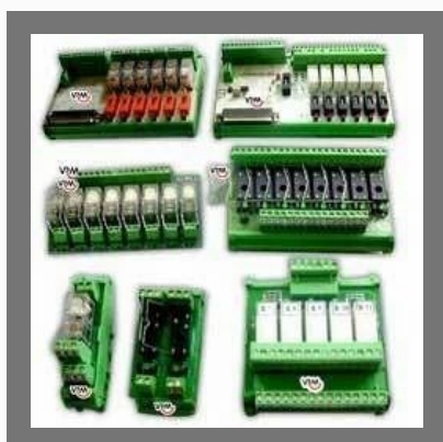
Electronic Relay Card