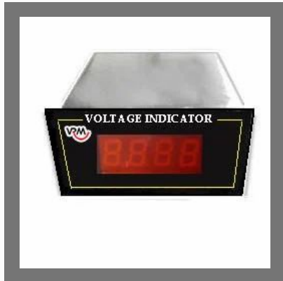
Voltage Indicator Device