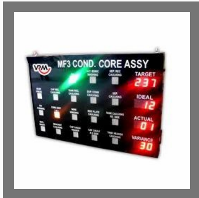
Production Display Board