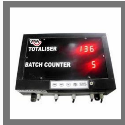
Electronic Bag Counter