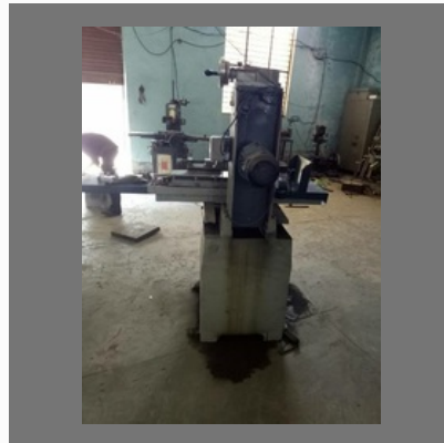
Die Casting Machines