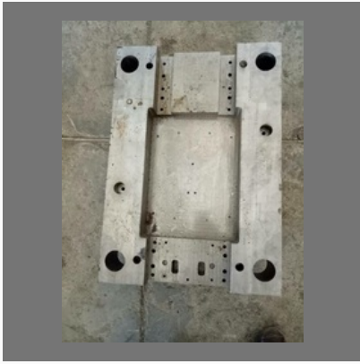
Sheet Metal Die