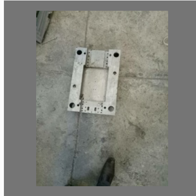
PDC Die Plate