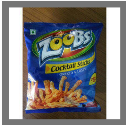
Crunchy and Crispy Cocktail Sticks