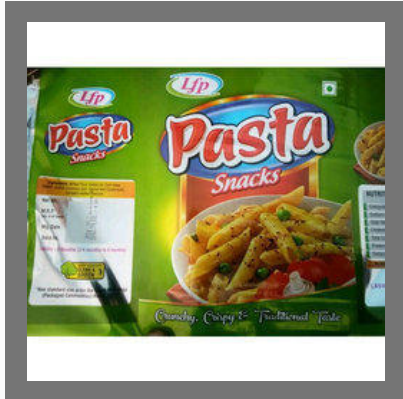
Pudina Pasta Snacks