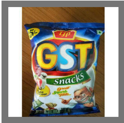
Tomato Flavoured Snacks Puffs