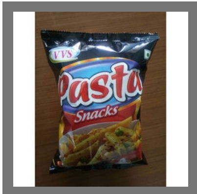
Fresh Pasta Fryums