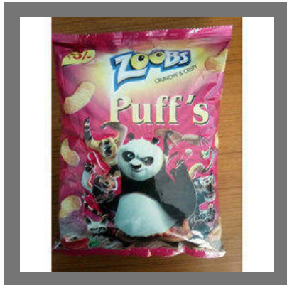
Cocktail Masala Puff