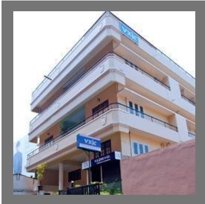
Trust Registration NGO Formation society Registratio