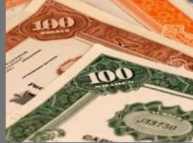
Govt. Bonds/ Fixed Deposit / Infrastructure bond