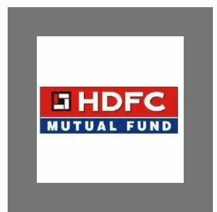
HDFC Mutual Fund