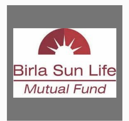
Birla Sunlife Mutual Fund