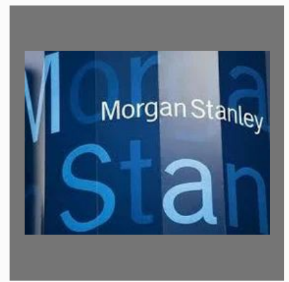
Morgan Stanley Mutual Fund