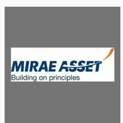
Mirae Asset Global Investments