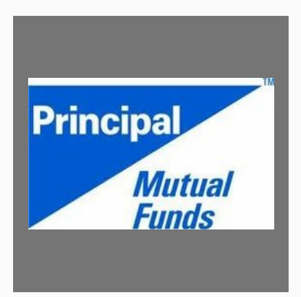
Principal Mutual Fund