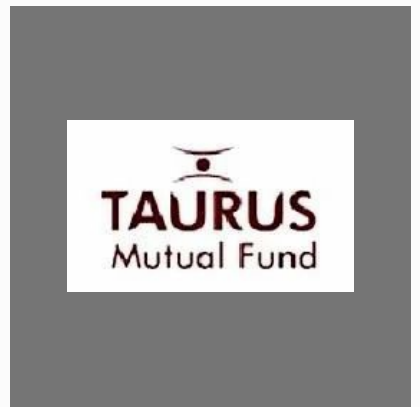
Taurus Mutual Fund