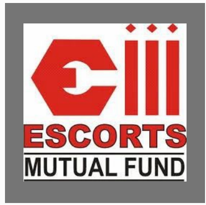
Escorts Mutual Fund