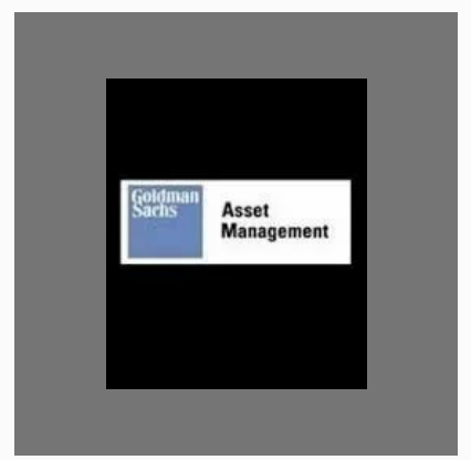
Goldman Sachs Mutual Fund