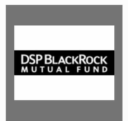
Dsp Blackrock Mutual Fund