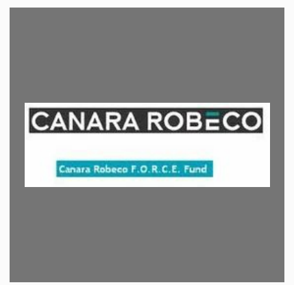
Canara Robeco Mutual Fund