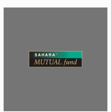
Sahara Mutual Fund