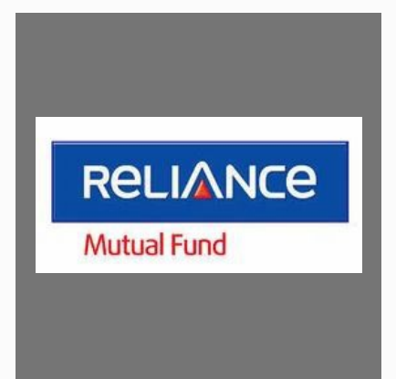
Reliance Mutual Fund