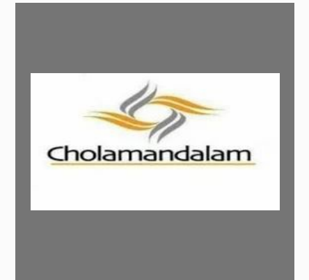
Cholamandalam Investment Service