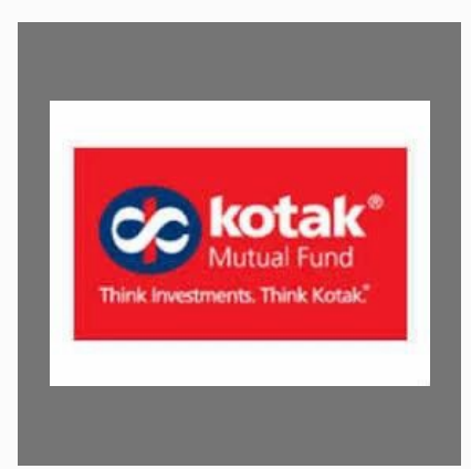
Kotak Mutual Fund