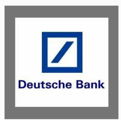
Deutsche Mutual Fund