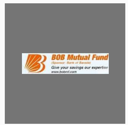
BOB Mutual Fund