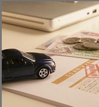
Car Insurance Services