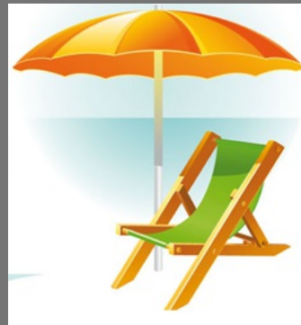
Travel Insurance services