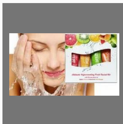
Home Fruit Facial Kit