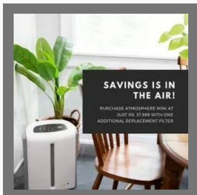
Room Air Purifier