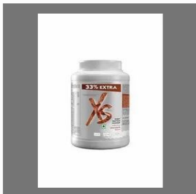
XS Whey Protein