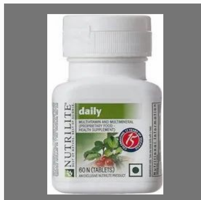
Nutrilite Daily Supplements