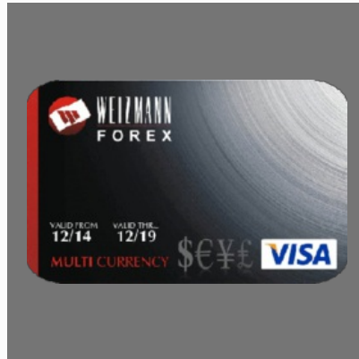
Weizmann Forex Multi Currency Travel Card Service