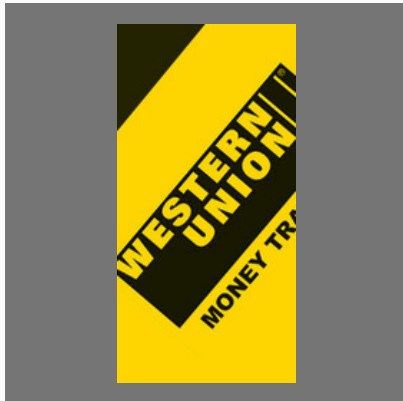
Western Union Business Solutions Service