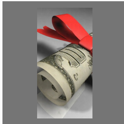
Money Transfer Service