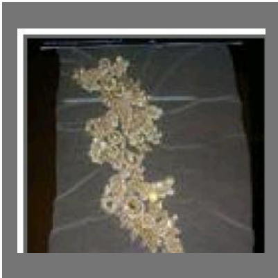
Applique Design Dress Material