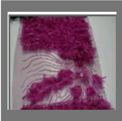
Allover Design Dress Material