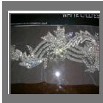
Applique Design Dress Material