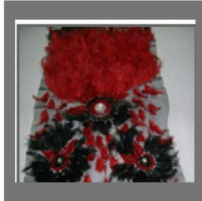
Allover Design Dress Material