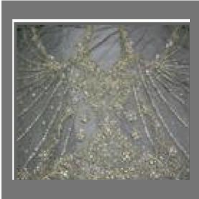
Bustier Design Dress