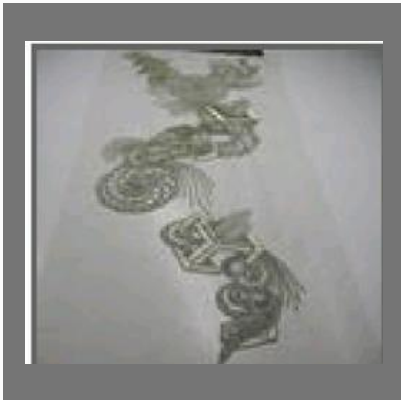
Front Panel Design Dress Fabric