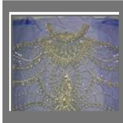
Bustier Design Dress Fabric