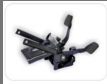
Break and Clutch