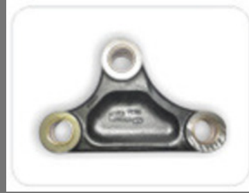
Bell Crank Lever