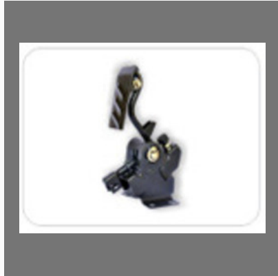
Accelerator Pedal Foot Control