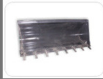
Loader Bucket for Black Hoe Loaders