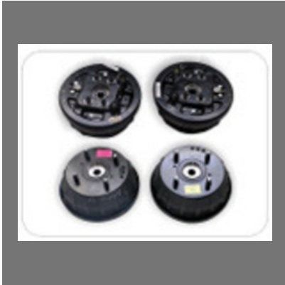
Rear Axle Banjo Beam