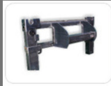
H Frames For Black Hoe Loaders