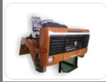
Tipper Truck Load Body