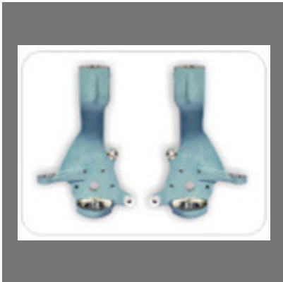
Passanger Car Segment