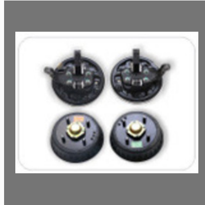
Front Axle Assembly