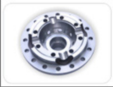
Differential Gear Housing