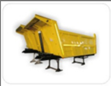
Tipper Truck Load Body