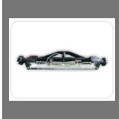
Off Highway Segment