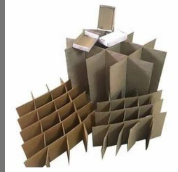
Corrugated Partition Trays