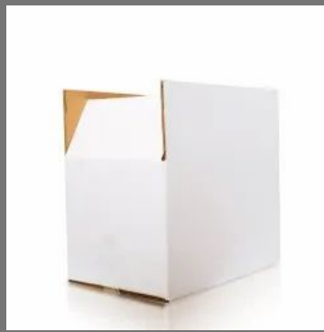
Folding Corrugated Box