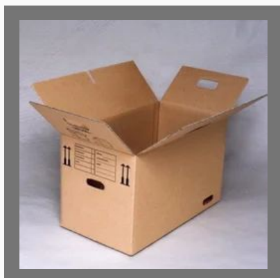
Corrugated Carton Box