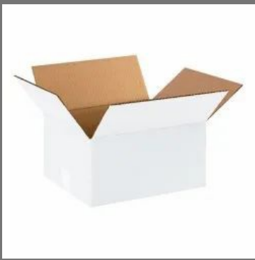
Plain Corrugated Box