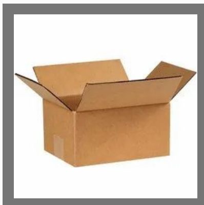
Industrial Corrugated Box