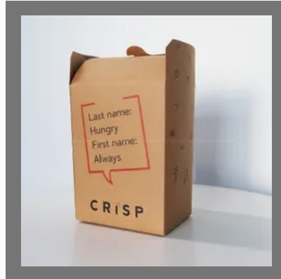
Corrugated Packaging Boxes