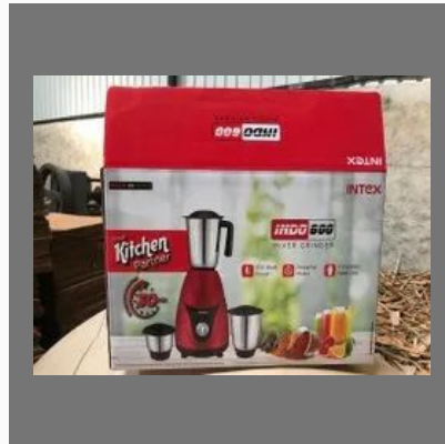
Mixer Grinder Packing Box