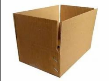
Plain Corrugated Box