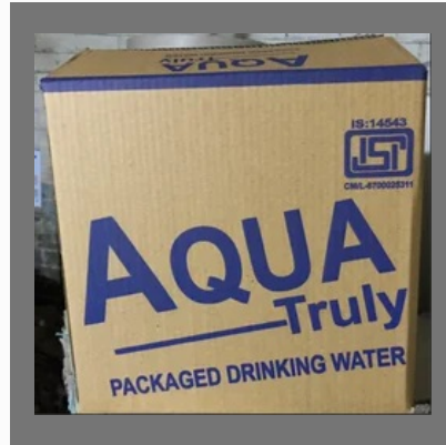
consumer goods packaging box