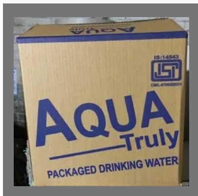
Water Bottle Box