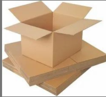
Heavy Duty Corrugated Box