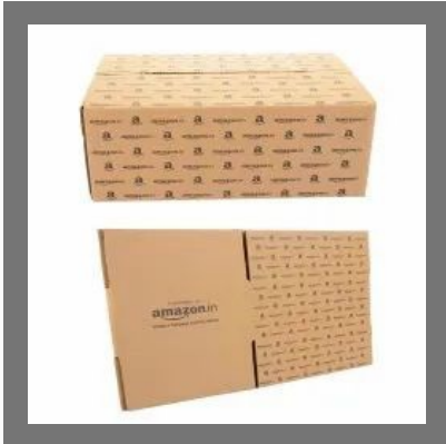
Cardboard Packaging Box