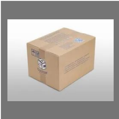
Heavy Duty Packaging Boxes