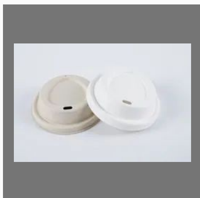
Disposable Biodegradable Sugarcane Bagasse Coffee Cup Lid