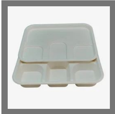
4 Compartment Sugarcane Bagasse Meal Tray