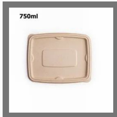
750ml Disposable Biodegradable Rectangular Container Lid