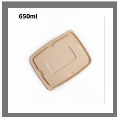
650ml Disposable Biodegradable Rectangular Container Lid