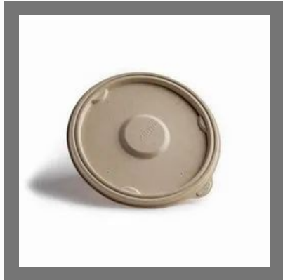
750ml Disposable Biodegradable Round Bowl Lid