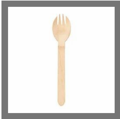
Disposable Wooden Spork 140mm