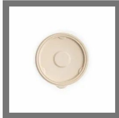
500ml Disposable Biodegradable Round Bowl Lid