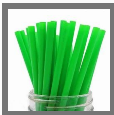
PlA Compostable Straws (6mm,8mm,10mm)