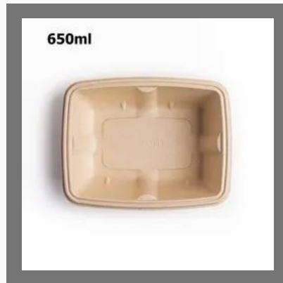
650ml Disposable Biodegradable Anti Leak Take Away Rectangular Container