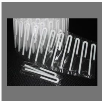
U Shaped Tetra Pack Straw