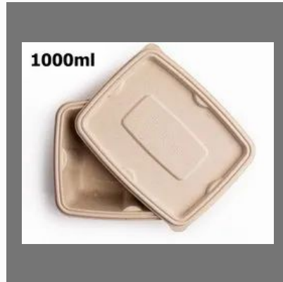
1000ml Disposable Biodegradable Anti Leak Take Away Rectangular Container