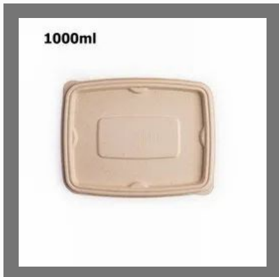
1000ml Disposable Biodegradable Rectangular Container Lid