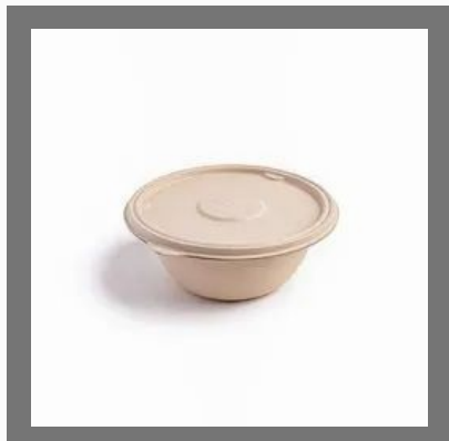
750ml Disposable Biodegradable Anti Leak Take Away Round Bowl