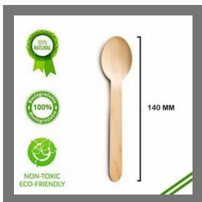
Disposable Wooden Spoon 140mm