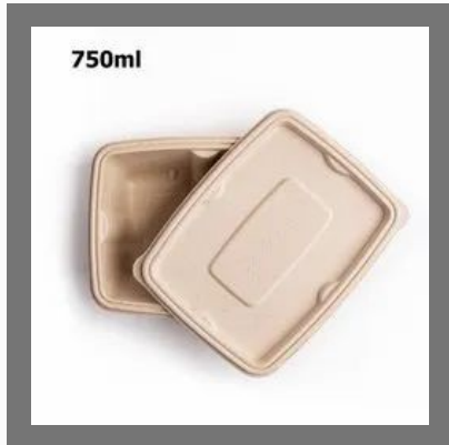
750ml Disposable Biodegradable Anti Leak Take Away Rectangular Container