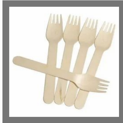
140mm Wooden Disposable Fork