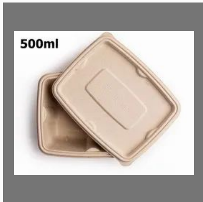
500ml Disposable Biodegradable Anti Leak Take Away Rectangular Container