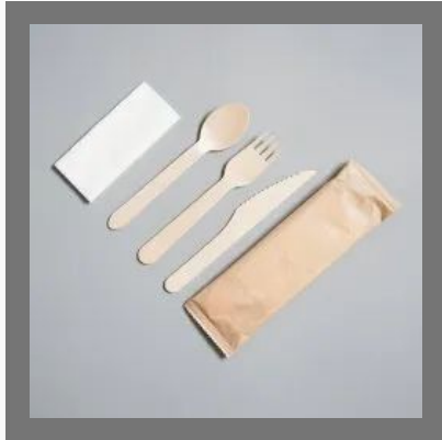
Disposable Biodegradable Wooden Cutlery Set