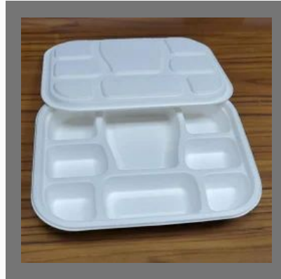
8 Compartment Sugarcane Bagasse Biodegradable Meal Tray 8CP