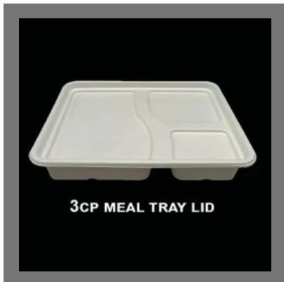
3 Compartment Sugarcane Bagasse Biodegradable Meal Tray 3CP