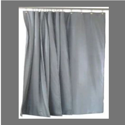
Lead Curtains. .