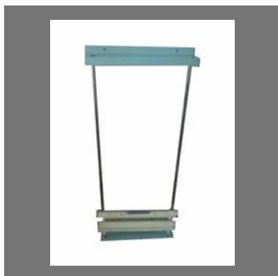
X Ray Chest Stand Wall Model