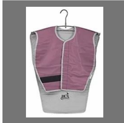
Breast Protection Lead Apron