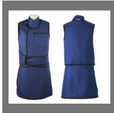
Skirt And Vest Lead Apron