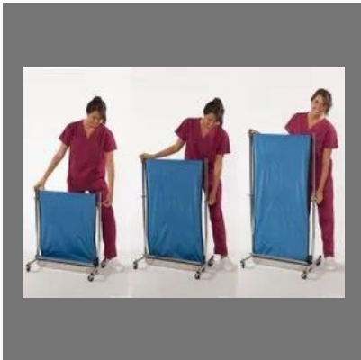
Adjustable Lead Curtain