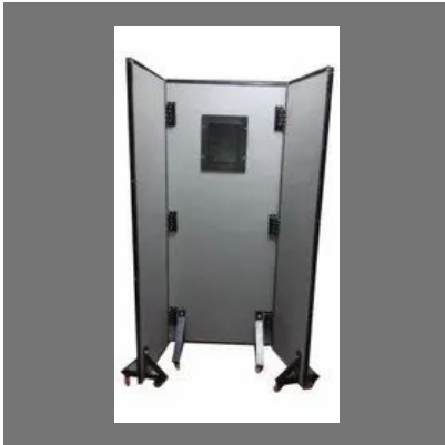
3 Panel Protection Screen