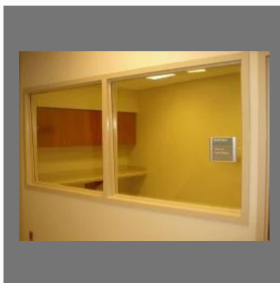
Rectangular Lead Glass