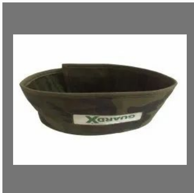
Lead Cap Radiation Protection