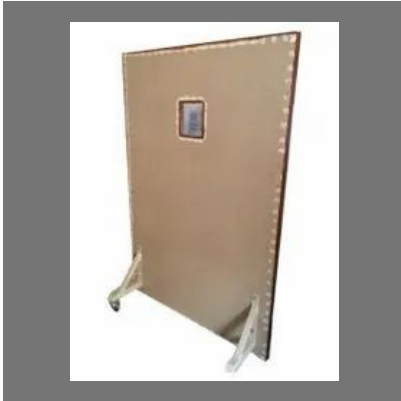
Protection Screen With Lockable Wheels