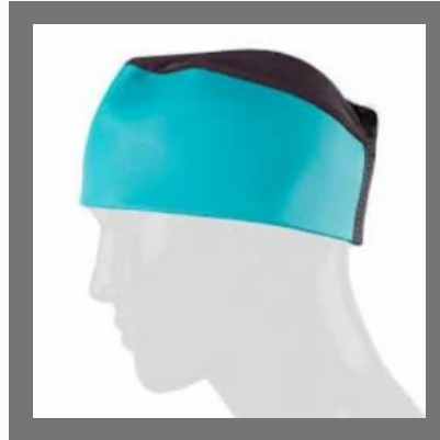
Lead Caps. .