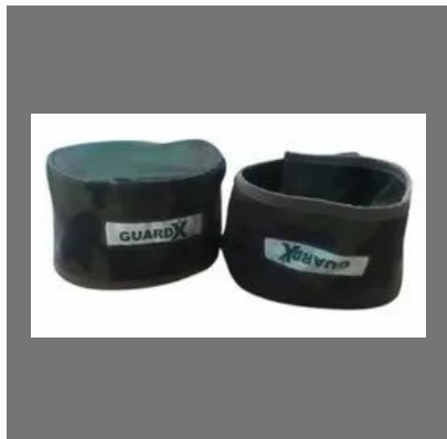
GuardX Lead Cap