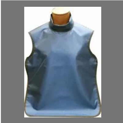
Dental Lead Apron