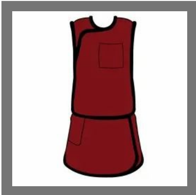
Skirt And Vest Overlap Lead Apron