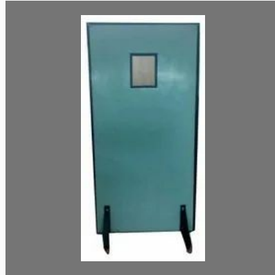
Single Panel Lead Protection Screen