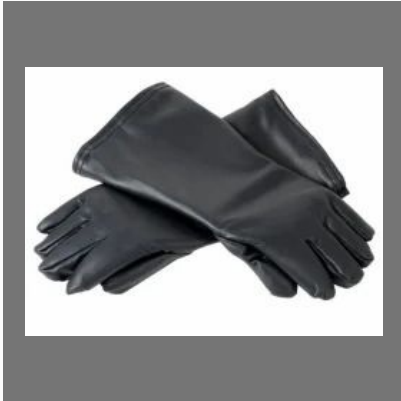
Lead Gloves. .