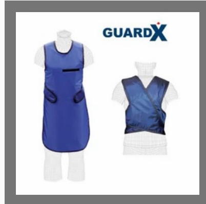
GuardX Lead Free Aprons