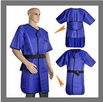
Wrap Around Double Sided Lead Apron