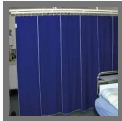
Lead Blue Curtain