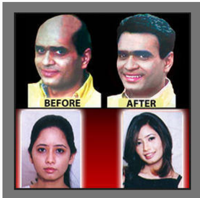
Permanent Treatment for Hairfall and Dandruff