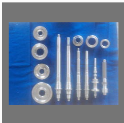
CNC Turning Component