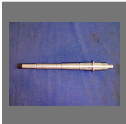
CNC Job Work on Output Shafts