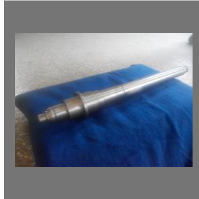
CNC Job Work on Main Shafts