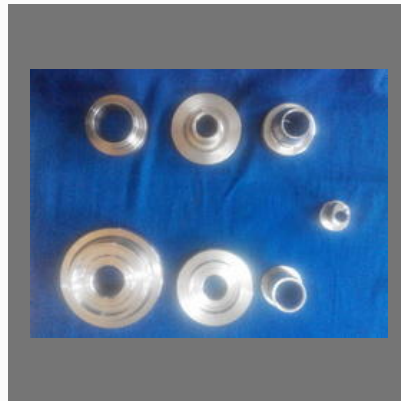
CNC Work on Automotive Gears