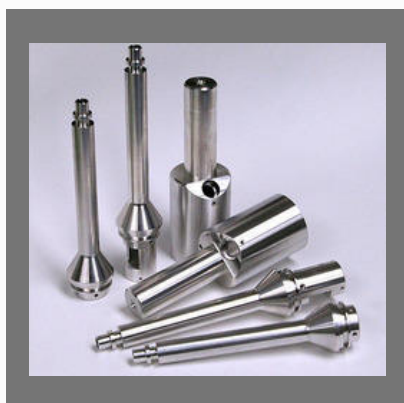
CNC Turning Job Work