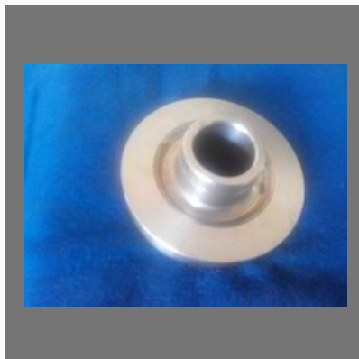
CNC Work on Constant Mesh Gear