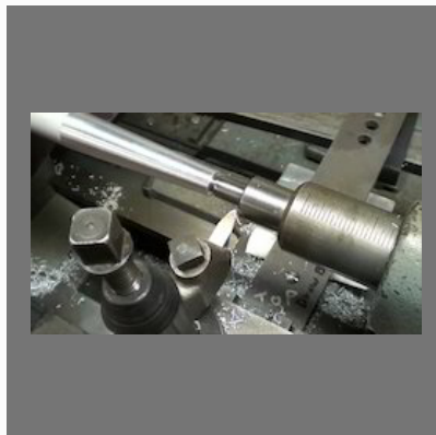
Lathe Machine Works