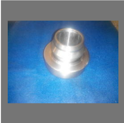
CNC Work on Reverse Idler Gear