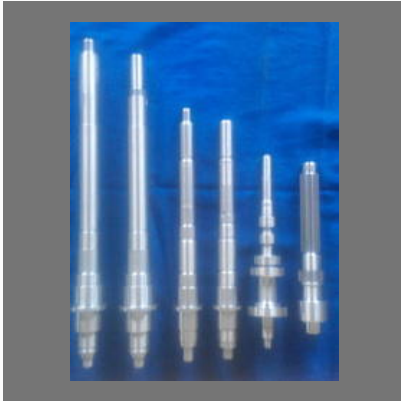
CNC Work on Automotive Shafts