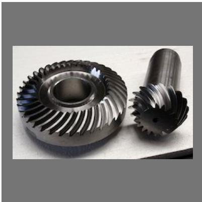
CNC Work on Four Speed Gears