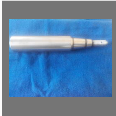
CNC Work on Tapper Pivot Shafts