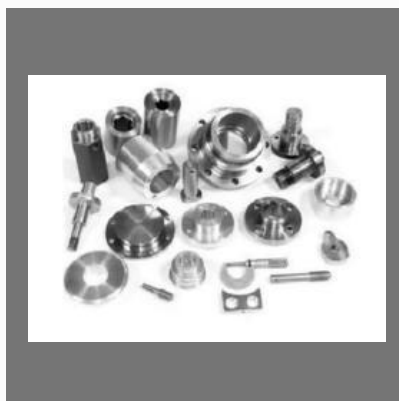
CNC Turned Components