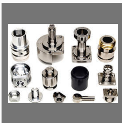
CNC Job Work