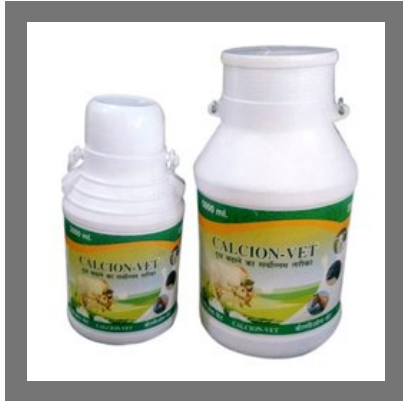
Calcion - Vet