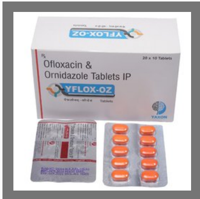
YFLOX- OZ Tablet