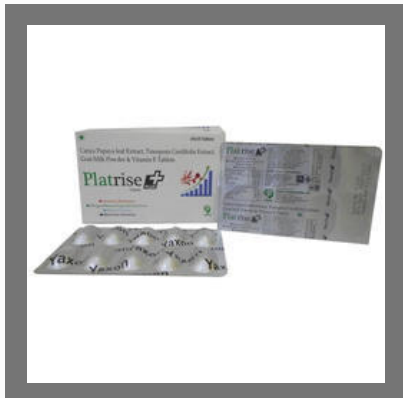
Platrise Plus Tablets