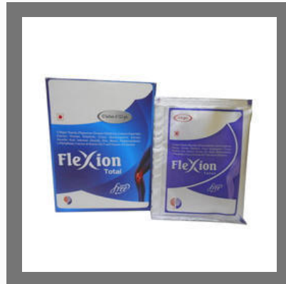
COLLAGEN PEPTIDE SACHET