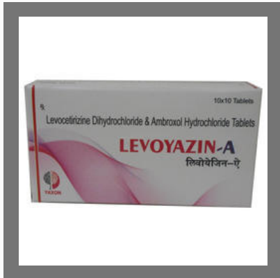
Levoyazin A Tablet