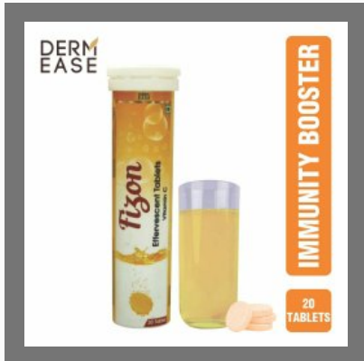
Fizon Effervescent Immunity Booster Tablet