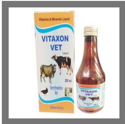
Vitaxon Vet Liquid