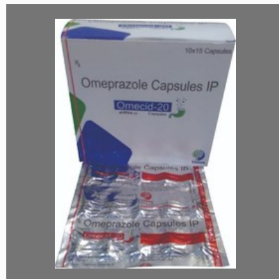
Omeclid 20 Capsule