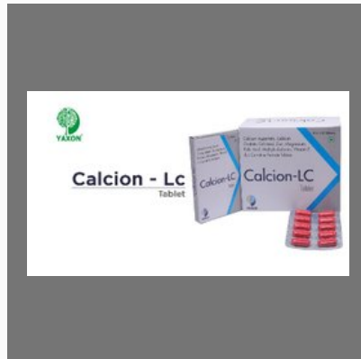
Calcion - LC Tablet