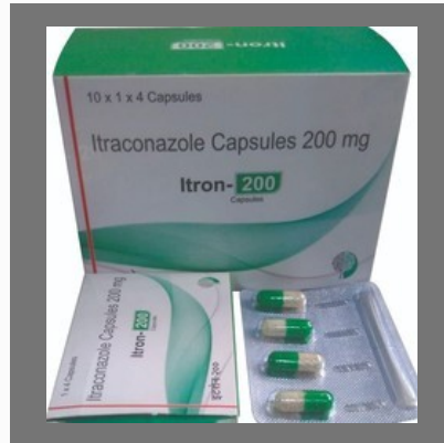
Itron 200 Capsule