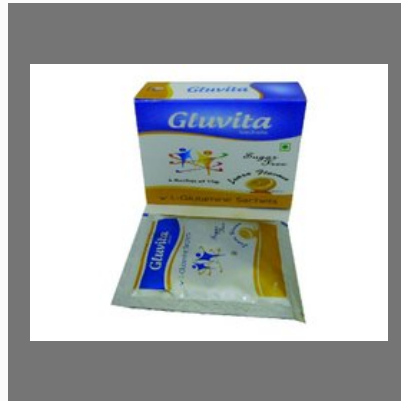
L Glutamin Sachet