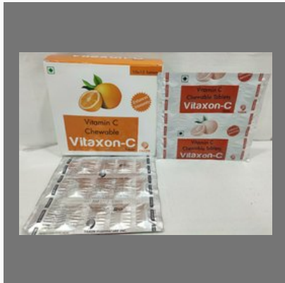
Vitaxon C Chewable Tablet