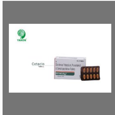
Cetaclo Plus Tablets