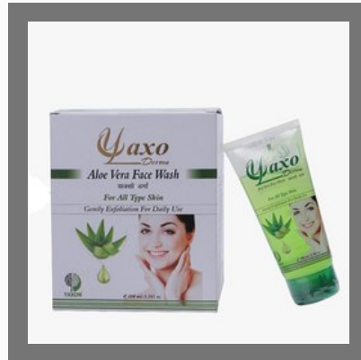
Yaxo Derma Aloe Vera Face Wash