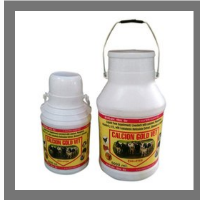
Calcion Gold - Vet