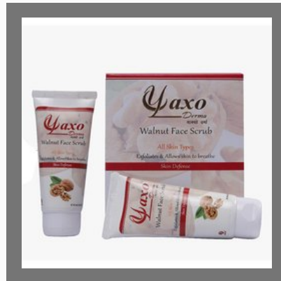
Yaxo Derma Walnut Face Scrub