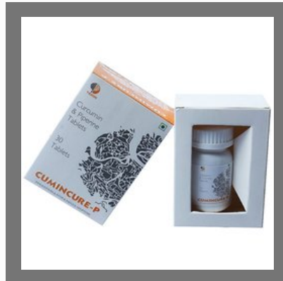
Curcumincure - P Tablet