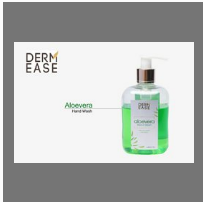
Aloe Vera Hand Wash