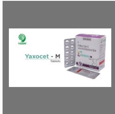
Yexocet - M Tablets