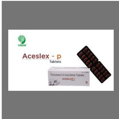
Aceslex - P Tablet