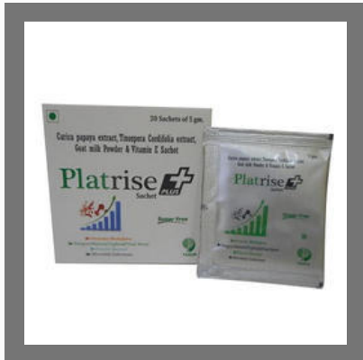
CARCIA PAPAYA SACHET