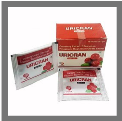
Uri Cran Sachet