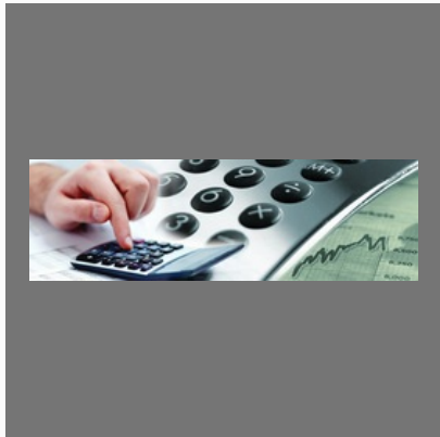
Indirect Tax Consulting Service