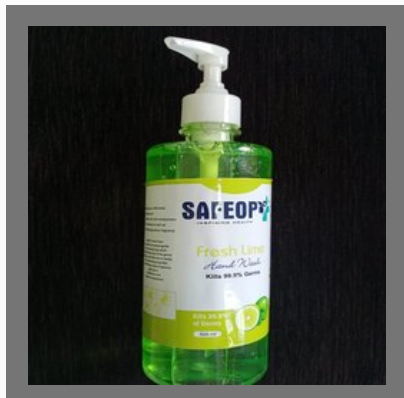
SAFEOPT HANDWASH 500ML