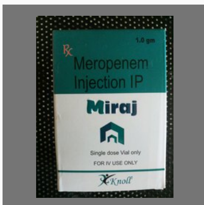
Meropenem Iniection IP