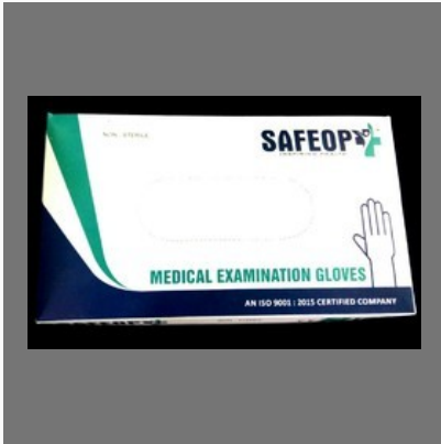
SAFEOPT Nitrile Examination Gloves