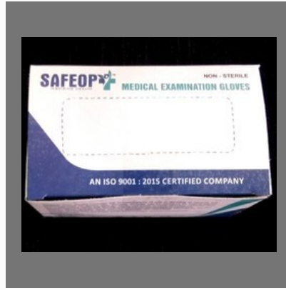
Examination Gloves 20 Pcs Pack