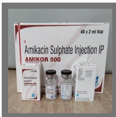
AMIKOR 500 Amikacin Sulphate Sterile