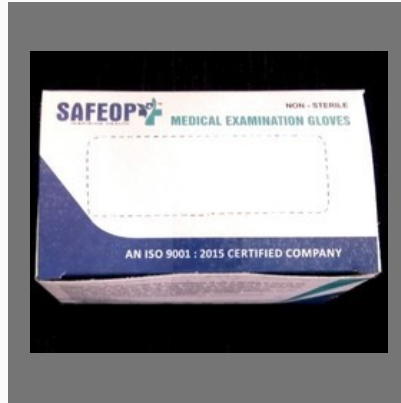
Safeopt N-30 Nitrile Gloves