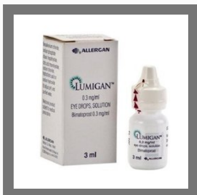
Lumigan 003 Eye Drops