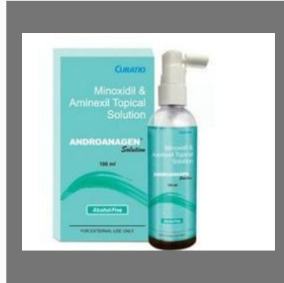
Androanagen Solution Topics