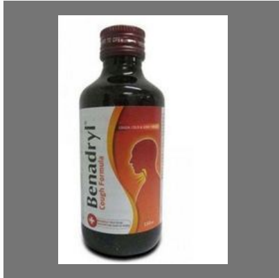
Benadryl C Formula Cough Syrup