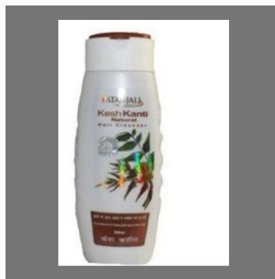
Kesh Kanti Natural Shampoo