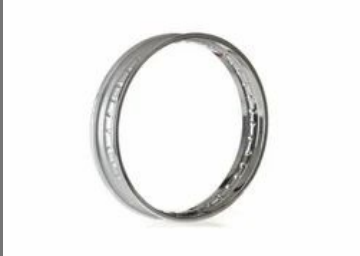
FRONT WHEEL RIM