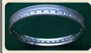
Front Wheel Rim