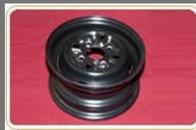
Bajaj 4 Wheeler Rim