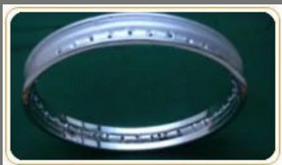
Front Wheel Rim