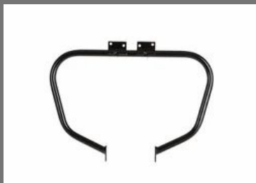
Single Type Powder Coated Leg Guard