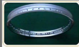
Front And Rear Wheel Rim