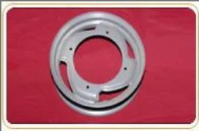
Spirit Wheel Rim