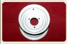
GC- 1000 Wheel Rim