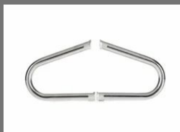
Split Type Nickel Chrome Plated Leg Guard