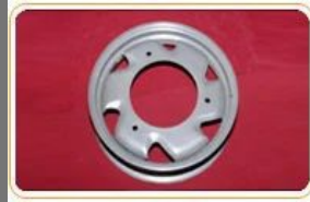
Kristal Wheel Rim