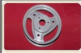
Spice Wheel Rim