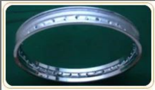
Rear Wheel Rim