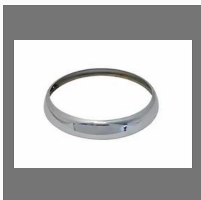
Head Lamp Rim