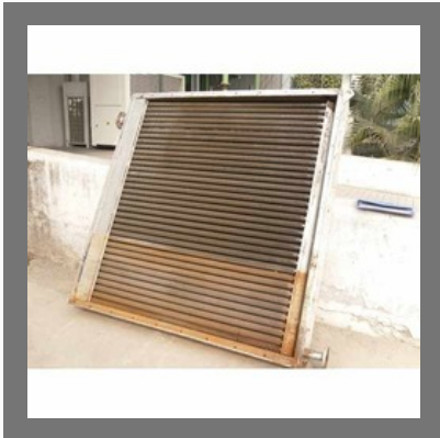
Finned Tube Heat Exchanger And Steam Radiator