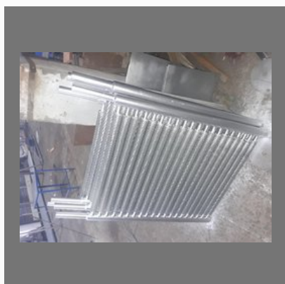
Tray Dryer Steam Coils