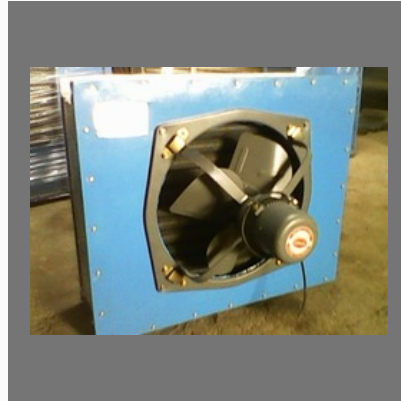
Air Cooled Oil Cooler