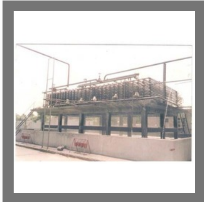
Ammonia Atmospheric Condenser