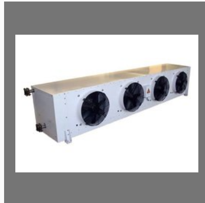
Ammonia Air Cooling Unit