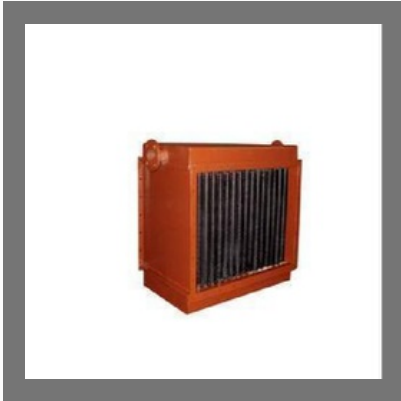
Air Oil Cooler