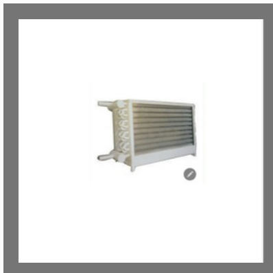
Steam Heating Coil