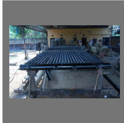
Spiral Finned Tube