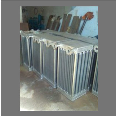
Textile Machine Radiator