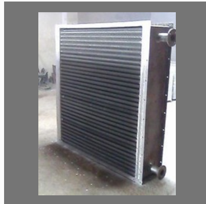
Air Heat Exchanger