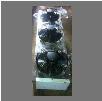
Banana Ripening Cold Room Unit