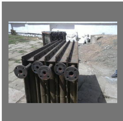
Modular Design Steam Radiator