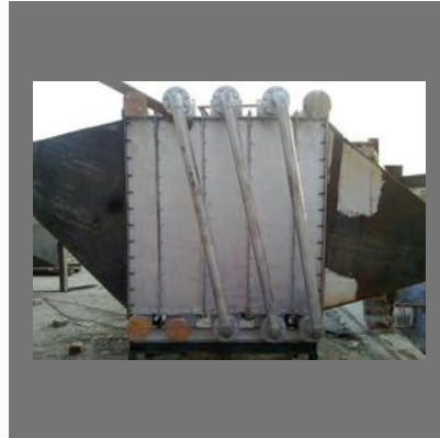
Steam Radiator for Glucose Plant