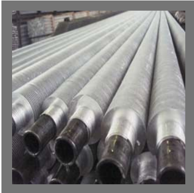
Extruded Aluminum Finned Tube