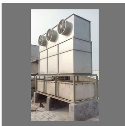
Ammonia Evaporative Condenser