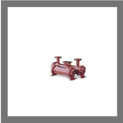
Hydraulic Oil Cooler