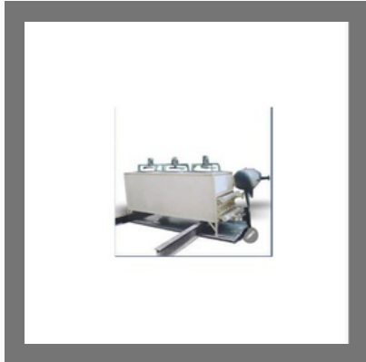
Air Cooling Unit - Bottom Flow