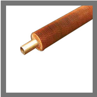
Crimped Copper Finned Tube