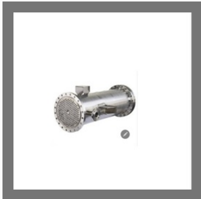
Shell and Tube Heat Exchanger