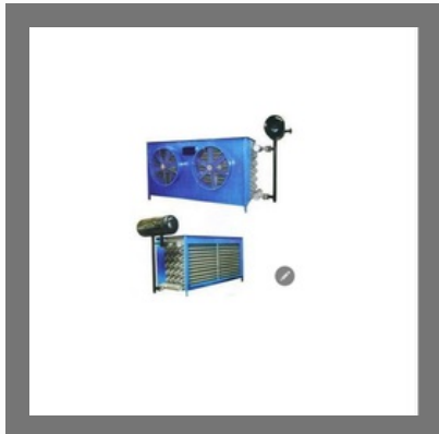
Ammonia Air Cooling Unit - Front Flow