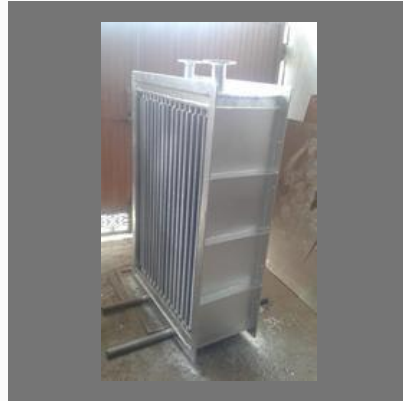
Thermic Fluid Heat Exchanger