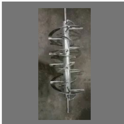
Paddle Mixer Grinder Shaft