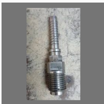
5inch Stainless Steel Nozzle