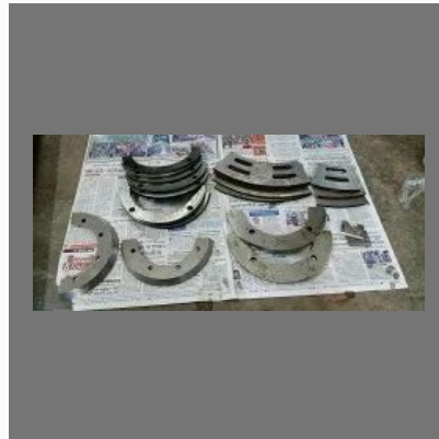
Blades For Rs4 Rotary Slotter Machine