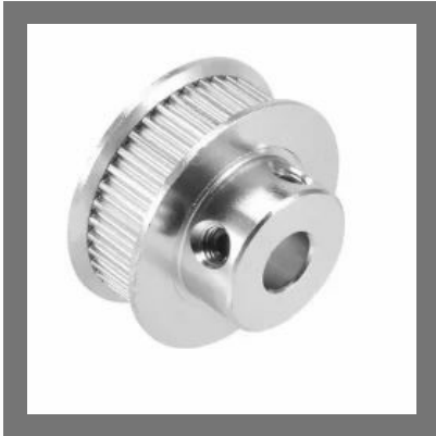
Aluminium Timing Pulleys