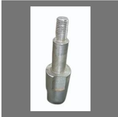
Mild Steel Acroflo Shaft