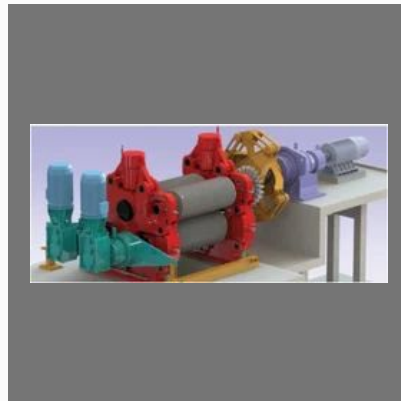
Sugar Mills Spare Parts