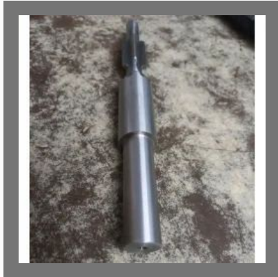
Mild Steel Pinion Gear Shaft