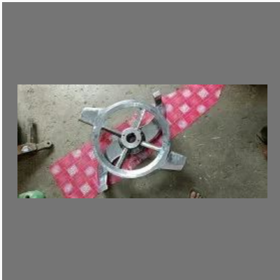
Pvc Mixer Machine Blade