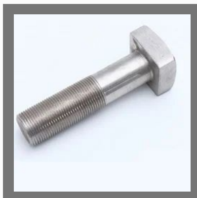
Ms Square Head Bolt