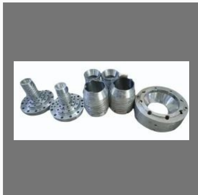
Aba Die Head