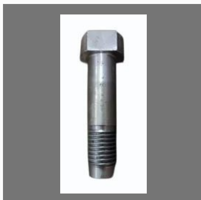
Mild Steel Square Head Bolt