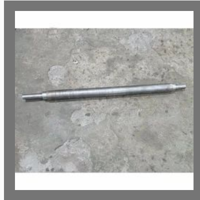
Mild Steel Cylindrical Shaft