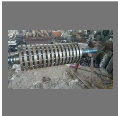
MS,SS Shaft with Router for Hammer Mill Cruisers Heavy Duty, For Industrial