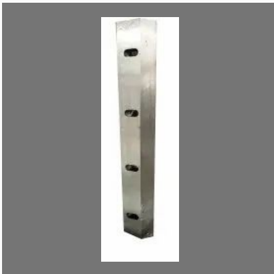
Pepar Cutting Blade