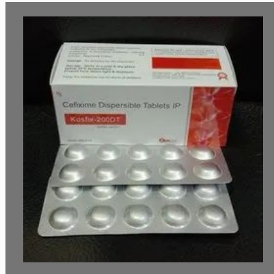
Cefixime Dispersible Tablets IP