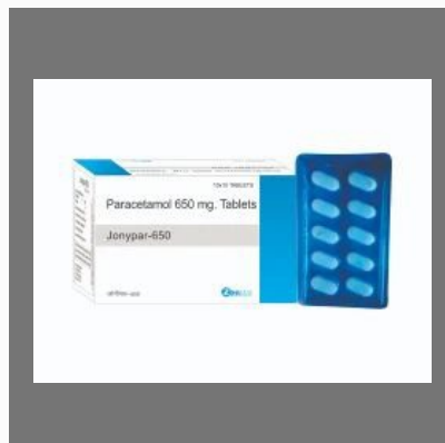
Paracetamol 650mg Tablet