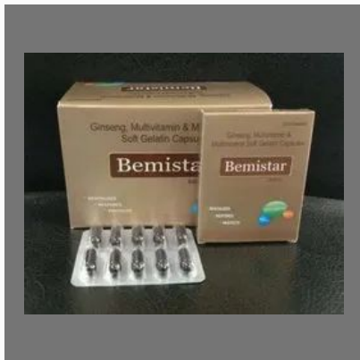
Ginseng, Multivitamin & Multimineral Soft Gelatin Capsules