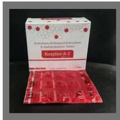
Multivitamin, Multimineral , Antioxidants & Methylcobalamin Tablets