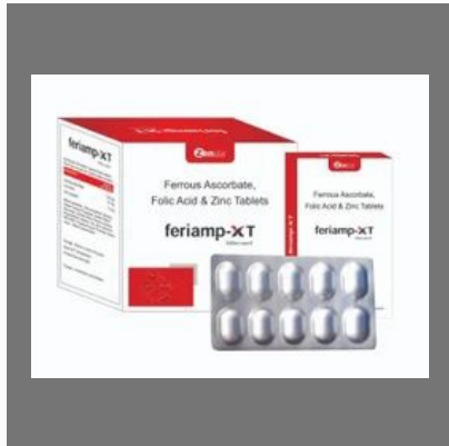
Ferrous Ascorbate Folic Acid & Zinc Tablet