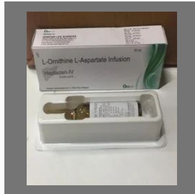
L-Ornithine L-Aspartate 5gm Infusion