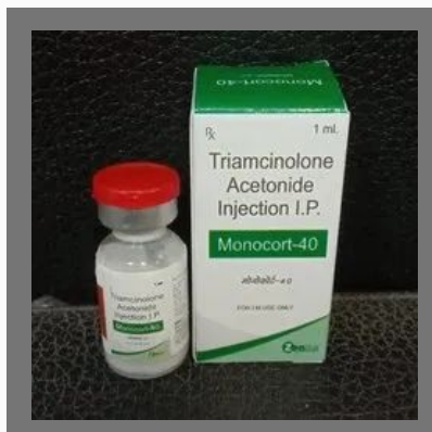
Triamcinolone Acetonide 40mg Injection