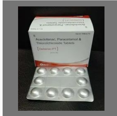
Aceclofenac Paracetamol & Thiocolchicoside Tablets