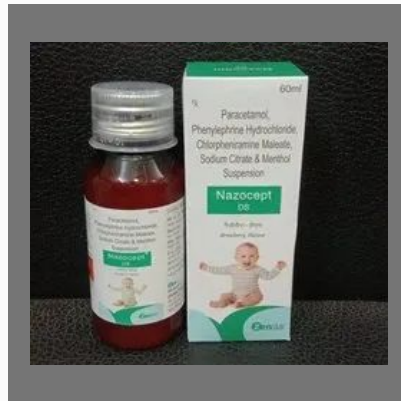
Paracetamol Phenylephrine CPM Suspension