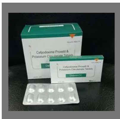
Cerpodoxime Proxetil & Potassium Clavulanate Tablets