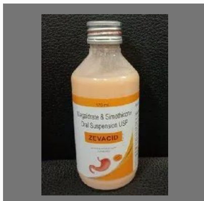
Megaldrate 400mg Simethicone 20mg Suspension