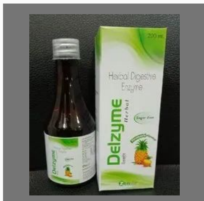
Vitamin B Complex Syrup