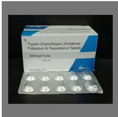
Trypsin-Chymotrypsin, Diclofenac Potassium & Paracetamol Tablets