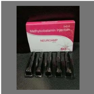
Mecobalamin 1500mg Injection