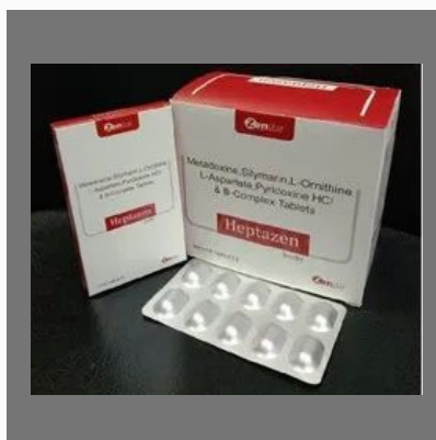
Heptazen Silymarine L- Ornithine L-Asparatase Complex Tablets