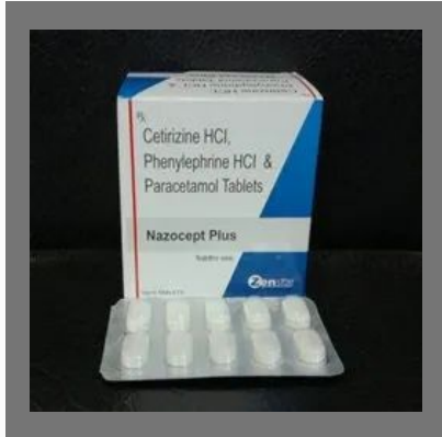
Cetirizine HCL, Phenylephrine HCL & Paracetamol Tablets