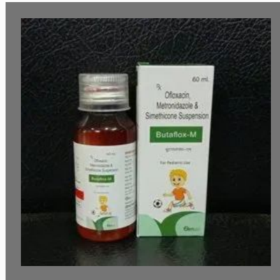
Ofloxacin, Metronidazole & Simethicone Suspension