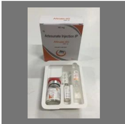
Artesunate Injection IP