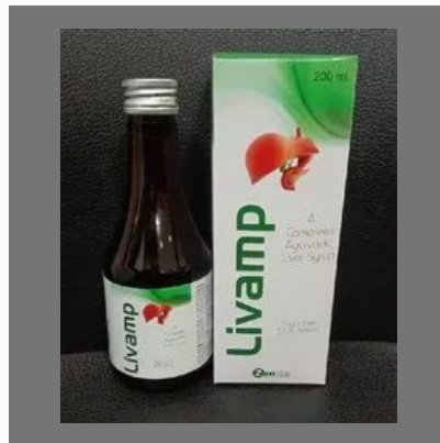
Ayurvedic Liver Formulations