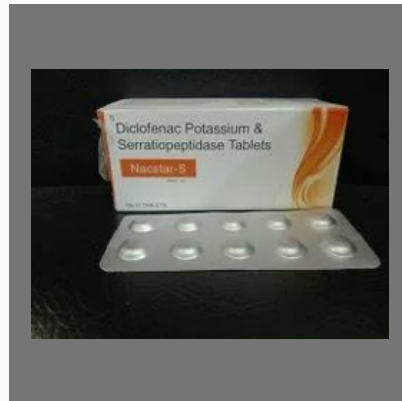
Nacstar S Medicine