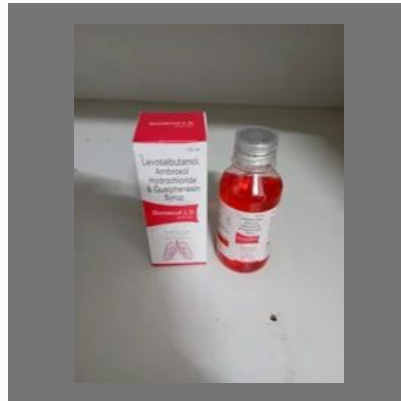
Levosalbutamol 1mg Ambroxol 30mg Guaiphenesin 50mg Syrup