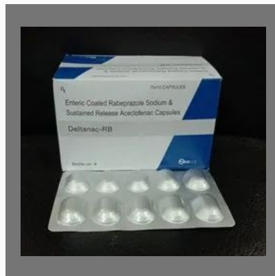
Enteric Coated Rabeprazole Sodium & Sustained Release Aceclofenac Capsules