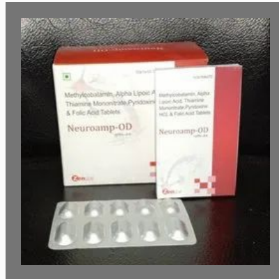
Mecobalamin, Alpha Lipoic Acid, Thiamine Mononitrate, Pyridoxine HCL & Folic Acid Tablets