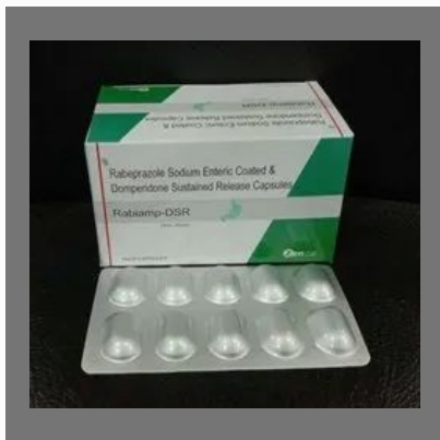
Rabeprazole Sodium Enteric Coated & Domperidone Sustained Release Capsules