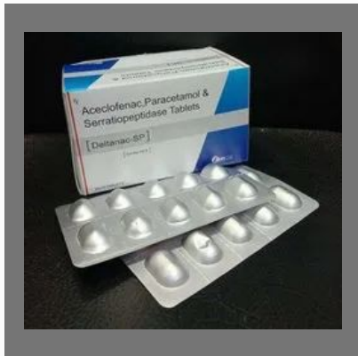
Aceclofenac, Paracetamol & Serratiopeptidase Tablets