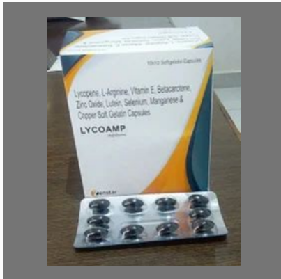
Lycopene Multivitamins Multiminerals Antioxidant capsules