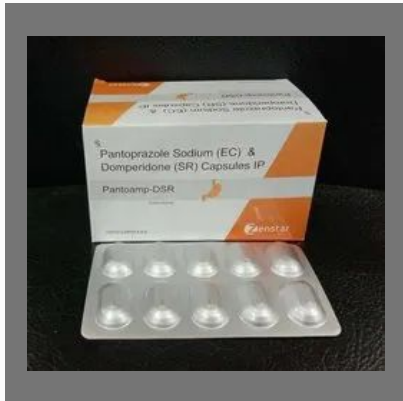
Pantoprazole Sodium (EC) & Domperidone (SR) Capsules IP