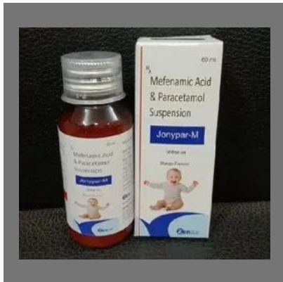
Mefenamic Acid Paracetamol Suspension