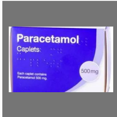
Paracetamol Tablet 500 Mg