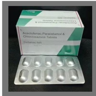
Aceclofenac Paracetamol Chlorzoxazone Tablets