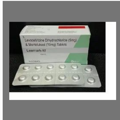
Montelukast Sodium Levocetirizine Tablet