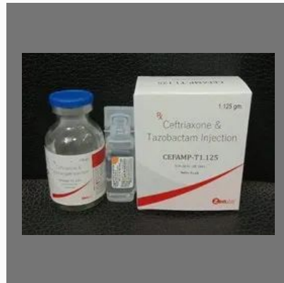
Ceftriaxone Tazobactam Injection