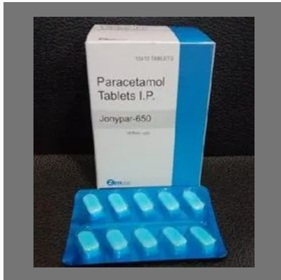
Paracetamol Tablets I.P