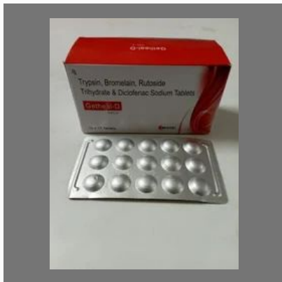
Trypsin Bromelain, Rutoside & Diclofenac Sodium Tablets