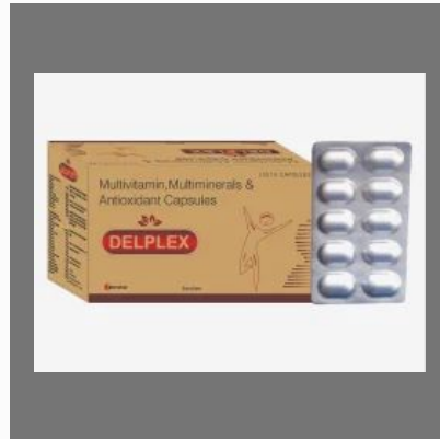
Multivitamin Multimineral Antioxidant Capsule