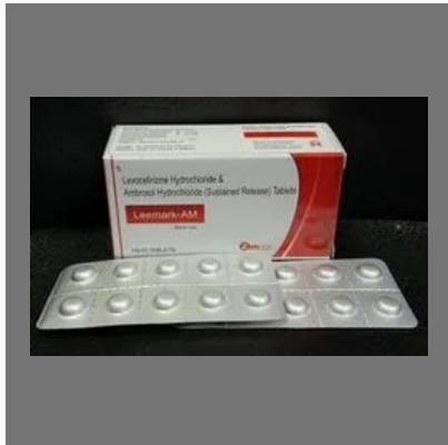
Levocetirizine Hydrochloride & Ambroxol Hydrochloride Tablets