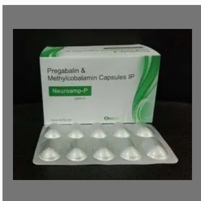
Pregabalin & Methylcobalamin Capsules IP