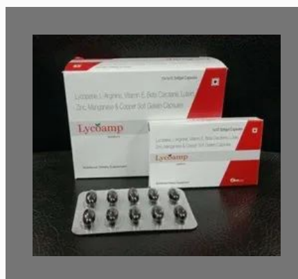
Lycopene, L-Arginine, Vitamin E, Beta Carotene, Lutein, Zinc, Manganese