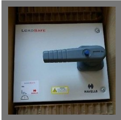
Havells Load Safe Switch Disconnecter Fuse