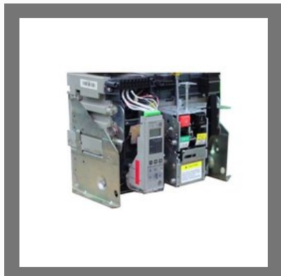
Air Circuit Breaker