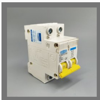
TOMZN TOB1Z-63 PV Solar Circuit Breaker