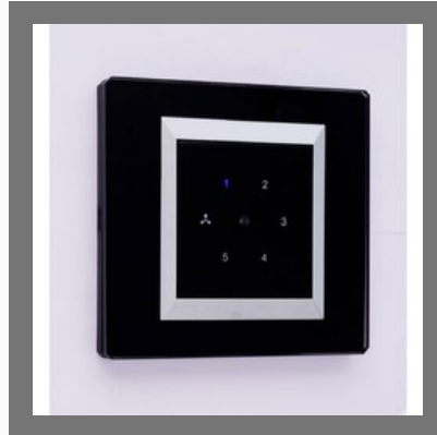
Modular Touch Switch