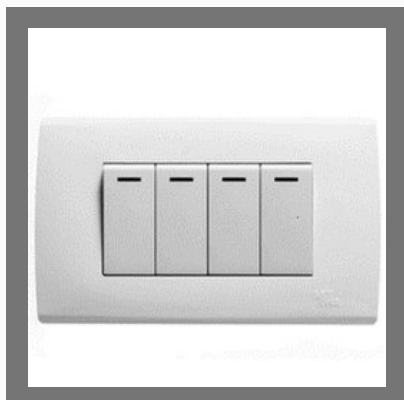
White Havells Modular Switches