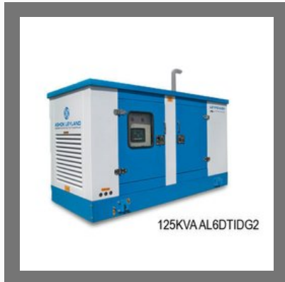
125 kVA Ashok Leyland Diesel Generator Set