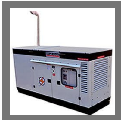
125 Kva Supernova Diesel Generator Set