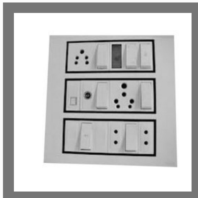
Electrical Switch Board