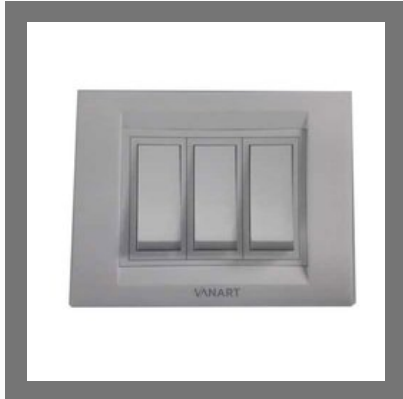
Vanart One Way Switch