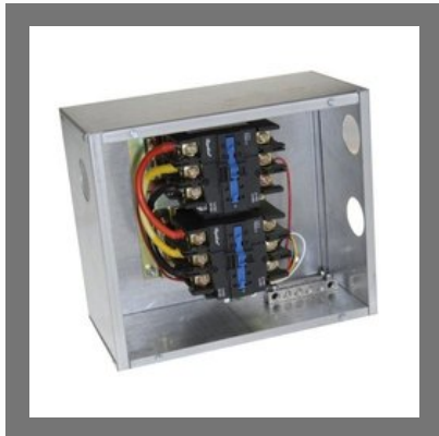
100 A Automatic Transfer Switch