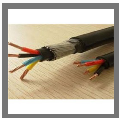
Underground Armoured Cable