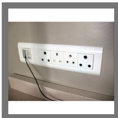
Electrical Wall Socket