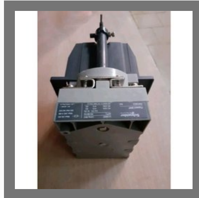
Schneider Electrical Fuse