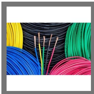
RR Kabel Power Cable