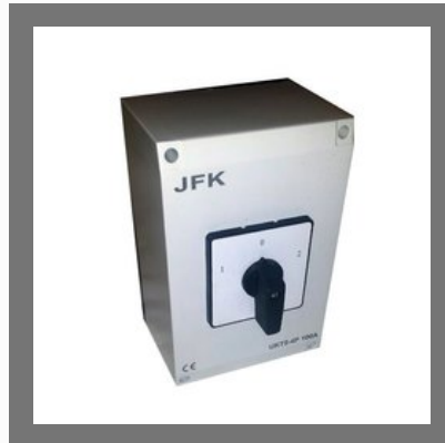
JFK Changeover Switch