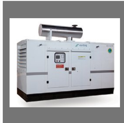
125 Kva Sterling Diesel Generator Set