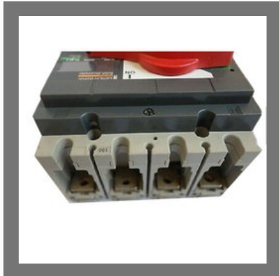
Main Switch Fuse Unit