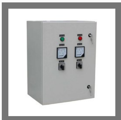
Automatic Transfer Switch Panel