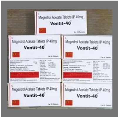
Megestrol Acetate Tablets