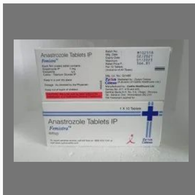
Femistra 1 Mg Tablets