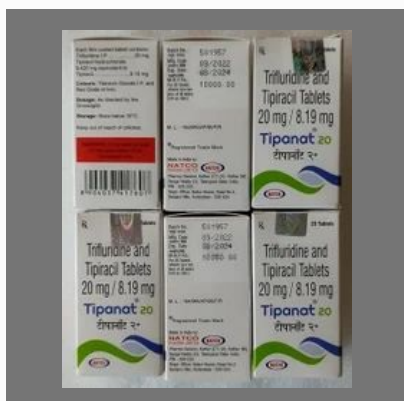
Tipanat 8.19mg/20mg Tablet