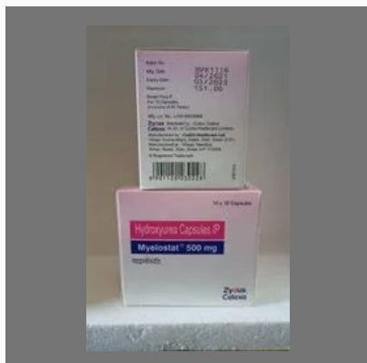
Myelostat Hydroxyurea Capsule 500mg