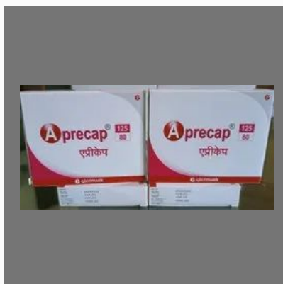
Apracap 125 Mg Capsule