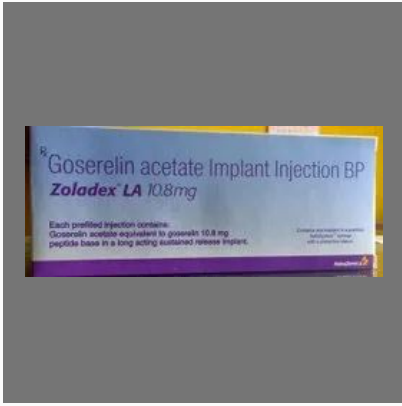
Zoladex La Goserelin Acetate 10.8 Mg Injection