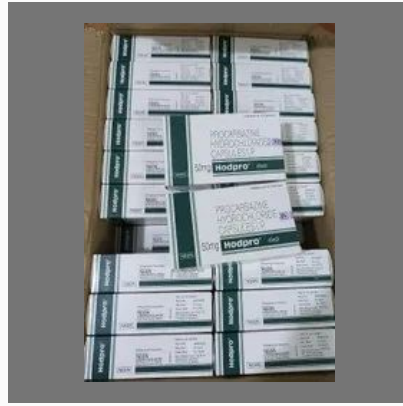
Hodpro 50mg Capsule