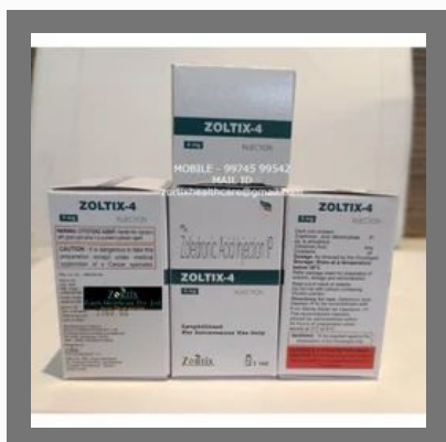
Zoltix 4mg (Zoledronic Injection 4mg)