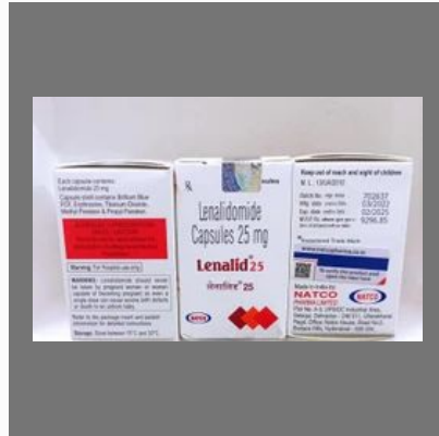
Lenalid 25 Mg Lenalidomide